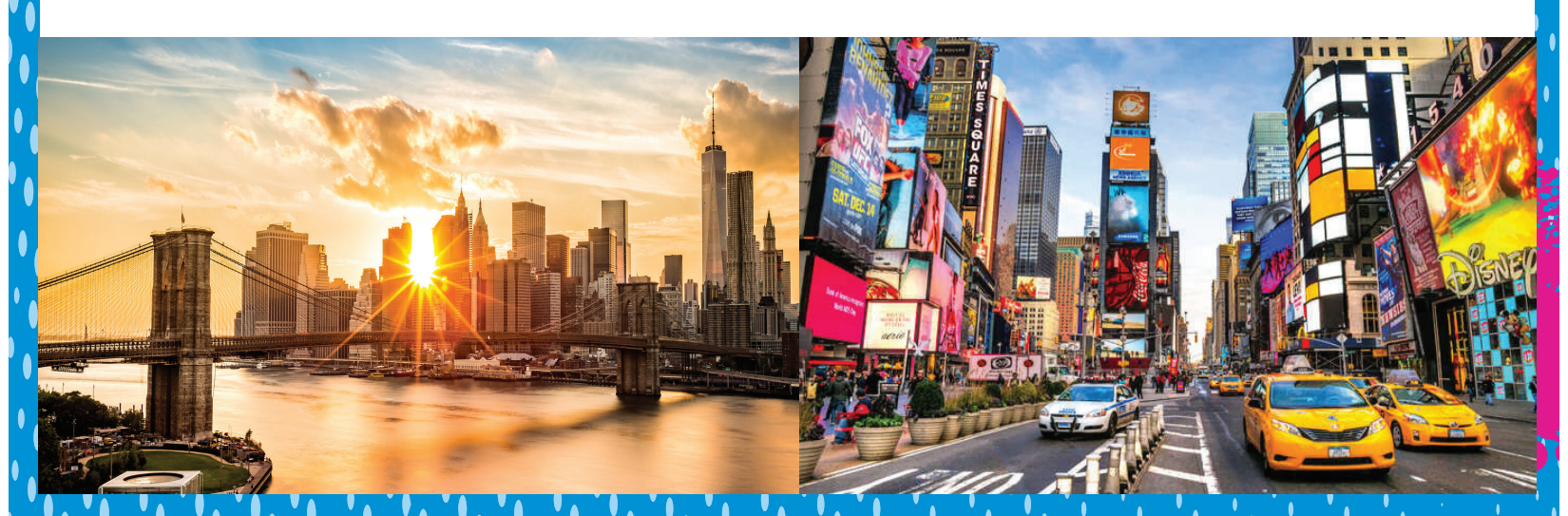
EXHIBIT DATES: NOVEMBER 28-DECEMBER 1