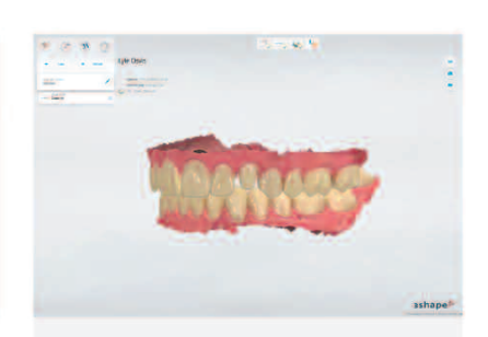
View the scans View TRIOS® 3D scans on any PC on the clinic network.

Your TRIOS® scans are automatically inserted in Dentrix® patient chart for future use.