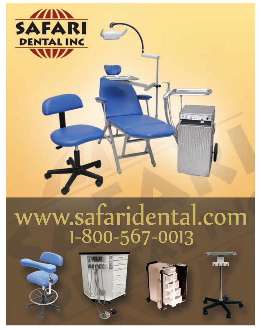
Interested? Circle Product Card No. 77