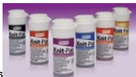
Booth 4606 Knit-Pak™ Gingival Retraction Cord from Premier® Dental Products Company

Invisalign® G4 from Align Technology Inc. is the next generation of SmartForce® clinical innovations, designed to address some of the treatment challenges doctors encounter. They are engineered to help doctors achieve better clinical results for open bite treatments, more predictable movement of upper laterals, and improved root control for canines and central incisors. Optimized Attachments and the Power Ridge® are engineered to deliver the forces needed to achieve predictable tooth movements. Visit aligntechinstitute.com/G4 .