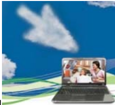
Booth 3801 CAESY Cloud from Patterson Dental

This is ideal for young patients who have orthodontic appliances and for those who struggle with traditional string floss. It is uniquely designed to accommodate smaller hands – ideal for ages six and up – and it has been clinically proven to be twice as effective as traditional floss for reducing gingival bleeding. It includes two tips – one Classic Jet Tip and one Orthodontic Tip – as well as an extra safe, kid-proof electrical design, three pressure settings, and compact size for easy storage. Visit www.waterpik.com .