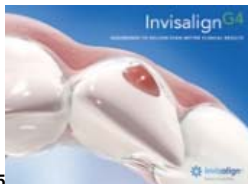
Booth 4625 Invisalign® G4 from Align Technology, Inc.

Invisalign® G4 from Align Technology Inc. is the next generation of SmartForce® clinical innovations, designed to address some of the treatment challenges doctors encounter. They are engineered to help doctors achieve better clinical results for open bite treatments, more predictable movement of upper laterals, and improved root control for canines and central incisors. Optimized Attachments and the Power Ridge® are engineered to deliver the forces needed to achieve predictable tooth movements. Visit aligntechinstitute.com/G4 .