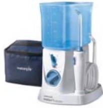
Booth 3415 Waterpik® Water Flosser for Kids from Water Pik, Inc.

This is ideal for young patients who have orthodontic appliances and for those who struggle with traditional string floss. It is uniquely designed to accommodate smaller hands – ideal for ages six and up – and it has been clinically proven to be twice as effective as traditional floss for reducing gingival bleeding. It includes two tips – one Classic Jet Tip and one Orthodontic Tip – as well as an extra safe, kid-proof electrical design, three pressure settings, and compact size for easy storage. Visit www.waterpik.com .