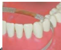
Perforated Diamond Strips from Axis Dental

New Perforated Diamond Strips from Axis Dental are designed for complete control during interproximal reduction, shaping, and contouring. Strips allow easy access and precise manual enamel reduction resulting in a smooth, natural finish. The perforated design assists in debris removal, provides improved visibility, control, and flexibility; made of stainless steel to resist breaking and stretching. Visit axisdental.com .