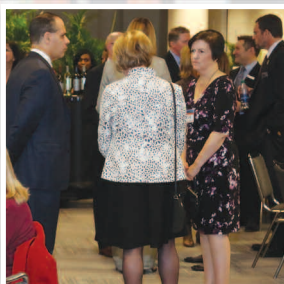
Oral Health America Celebrates 60 Years