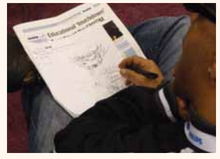
An attendee takes notes at a live-dentistry session at the 2011 GNYDM.

• Three tech pavilions are being added to the exhibit floor, focusing on CAD/CAM,