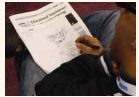
An attendee takes notes at a live-dentistry session at the 2011 GNYDM.

The GNYDM has room blocks at 39 hotels in Manhattan, with free round-trip bus service to the convention center. Visit the hotels and transportation page online at www.gnydm.com for room rates. And, as always, registration for the GNYDM is free.